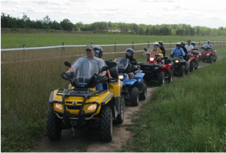
Townsend area riders shown on the new O'Brien property trail near Animal's Bear Trail. Hidden Bear Trail ATV Club and Red Arrow teamed up to make the link from Townsend to Animal's possible.